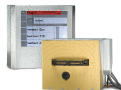
Videojet IP DataFlex Plus TTO

Videojet IP65 and IP66 rated coders are designed for washdown environments and utilize superior 316 grade stainless steel. Contact Videojet to discuss your variable coding needs today.