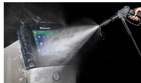
Videojet 1860 CIJ printer